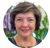
Vesna Tomljenović Judge, Court of Justice of the European Union